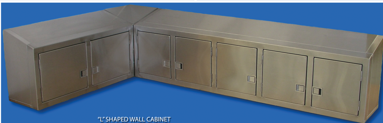
"L" SHAPED WALL CABINET