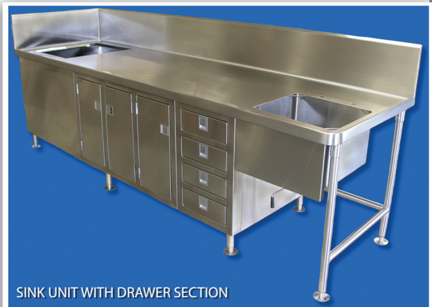
SINK UNIT WITH DRAWER SECTION