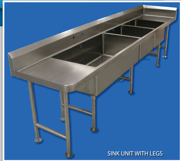
SINK UNIT WITH LEGS