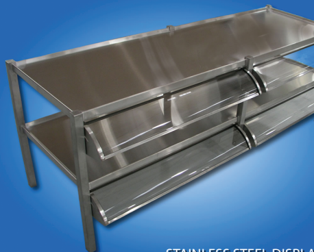
STAINLESS STEEL DISPLAY