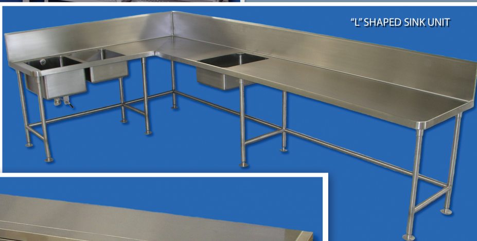
"L" SHAPED SINK UNIT