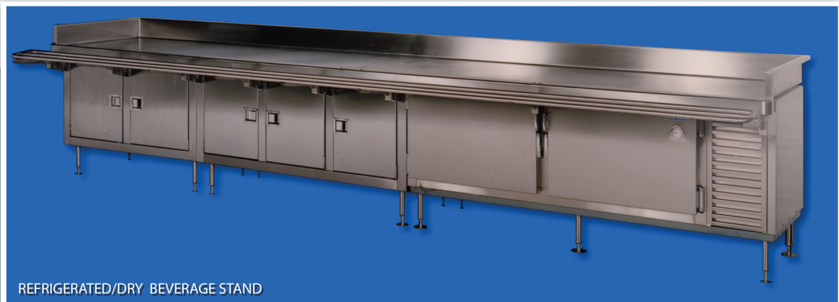
REFRIGERATED/DRY BEVERAGE STAND